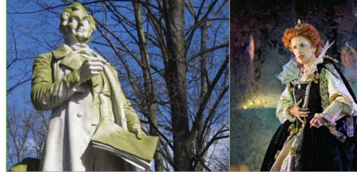
STATUE OF ALBERT LORTZING.