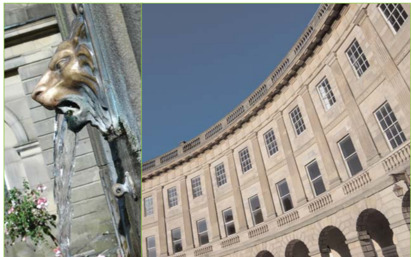
LEFT TO RIGHT: ST ANNES WELL HEAD. BUXTON'S GRADE 1 LISTED CRESCENT

A spokesman said, "once the outcome of investigations is known, we can envisage an early start on site to begin this unique development"